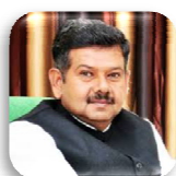
Chief Guest Shri Bhanwar Singh Bhati Hon'ble Minister of Higher Education, Govt. of Rajasthan

Celebration of Gandhi Jayanti (2 nd Oct-2020) From 10:30 AM to 1:30 PM